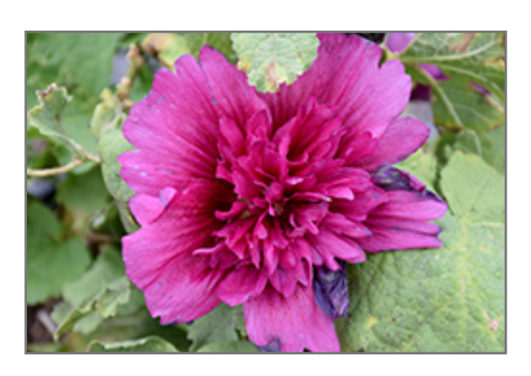
Spring Celebrities Purple Hollyhock flowers