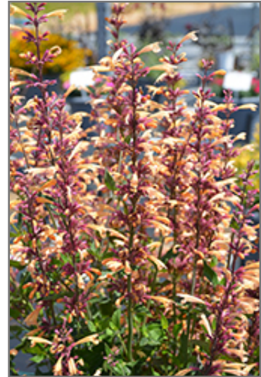
Meant To Bee Queen Nectarine Anise Hyssop flowers

Meant To Bee Queen Nectarine Anise Hyssop is recommended for the following landscape applications;