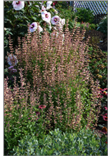
Meant To Bee Queen Nectarine Anise Hyssop in bloom

Meant To Bee Queen Nectarine Anise Hyssop is a fine choice for the garden, but it is also a good selection for planting in outdoor pots and containers. With its upright habit of growth, it is best suited for use as a 'thriller' in the 'spiller-thriller-filler' container combination; plant it near the center of the pot, surrounded by smaller plants and those that spill over the edges. It is even sizeable enough that it can be grown alone in a suitable container. Note that when growing plants in outdoor containers and baskets, they may require more frequent waterings than they would in the yard or garden. Be aware that in our climate, most plants cannot be expected to survive the winter if left in containers outdoors, and this plant is no exception. Contact our experts for more information on how to protect it over the winter months.