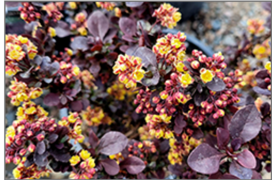
Concorde Japanese Barberry flowers

Concorde Japanese Barberry will grow to be about 18 inches tall at maturity, with a spread of 24 inches. It tends to fill out right to the ground and therefore doesn't necessarily require facer plants in front. It grows at a slow rate, and under ideal conditions can be expected to live for approximately 20 years.