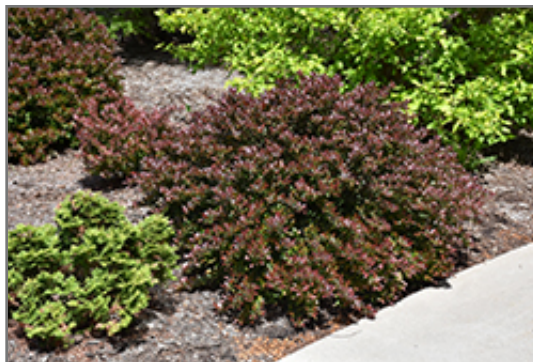
Concorde Japanese Barberry