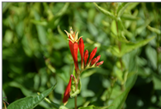
Ragin Cajun Indian Pink flowers