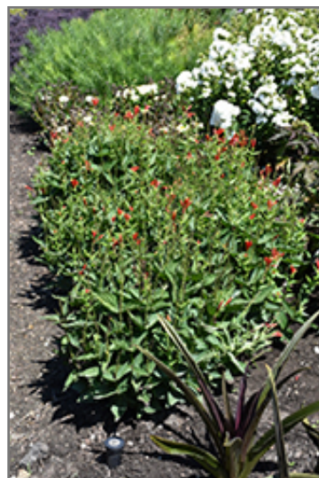
Ragin Cajun Indian Pink in bloom