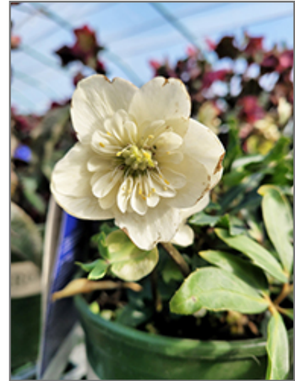
Winter Dreams Double Fantasy Hellebore flowers

Winter Dreams Double Fantasy Hellebore is recommended for the following landscape applications;