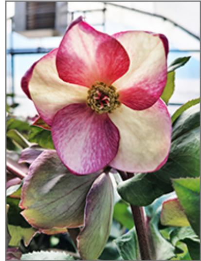
HGC Ice N' Roses Rosado Hellebore flowers