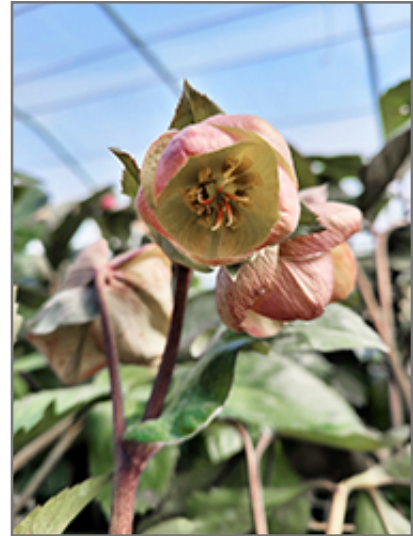
HGC Ice N' Roses Bianco Hellebore flowers