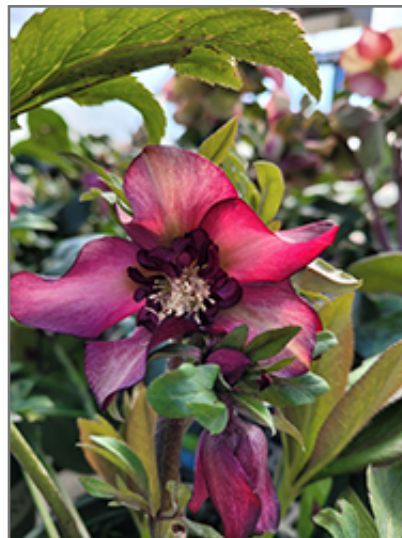
Cascade Blush Hellebore flowers