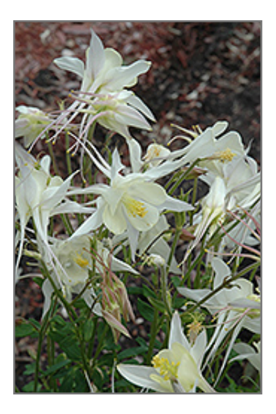
Crystal Star Columbine flowers