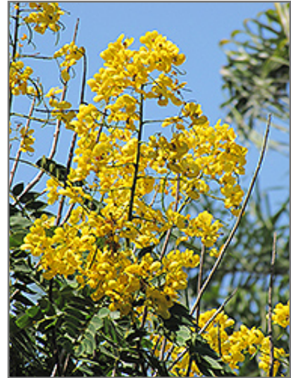
Whitebark Senna flowers

This tree will require occasional maintenance and upkeep, and should only be pruned after flowering to avoid removing any of the current season's flowers. It is a good choice for attracting birds and bees to your yard. Gardeners should be aware of the following characteristic(s) that may warrant special consideration;