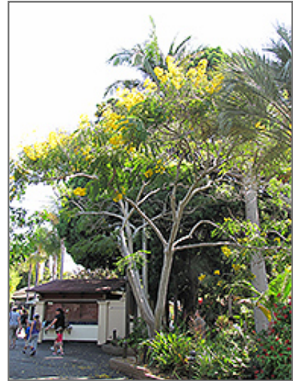
Whitebark Senna in bloom

This tree should only be grown in full sunlight. It is very adaptable to both dry and moist locations, and should do just fine under average home landscape conditions. It is not particular as to soil type or pH. It is somewhat tolerant of urban pollution. This species is not originally from North America, and parts of it are known to be toxic to humans and animals, so care should be exercised in planting it around children and pets.