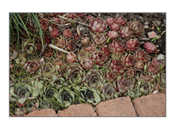
The Police Hens And Chicks

This selection features symmetrical, tightly packed rosettes of olive green, tipped and backed with burgundy; holds color well through the season; deep pink star flowers appear in summer; ideal for rock gardens and containers