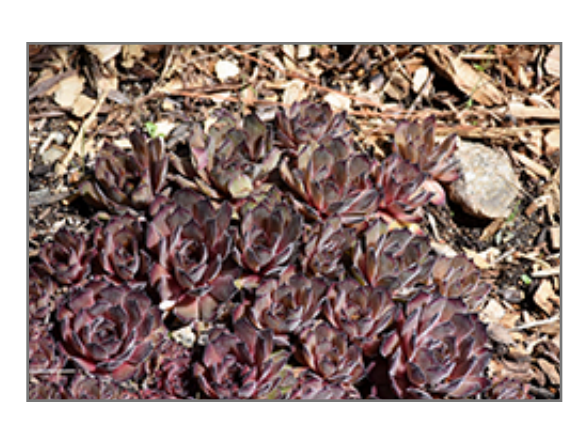
Proud Zelda Hens And Chicks

This matt forming selection features symmetrical rosettes of blue-green leaves with dark red tips and bronzy overtones; fine hairs give the leaves a silvery edge; pretty pink star flowers appear in summer; ideal for rock gardens and containers