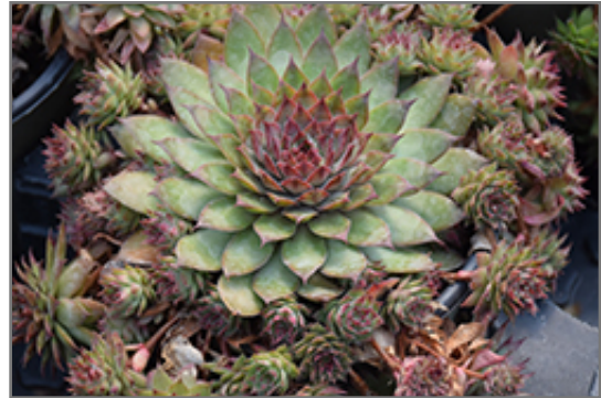
Chick Charms Butterscotch Baby Hens And Chicks

Chick Charms Butterscotch Baby Hens And Chicks is a dense herbaceous perennial with tall flower stalks held atop a low mound of foliage. Its relatively fine texture sets it apart from other garden plants with less refined foliage.