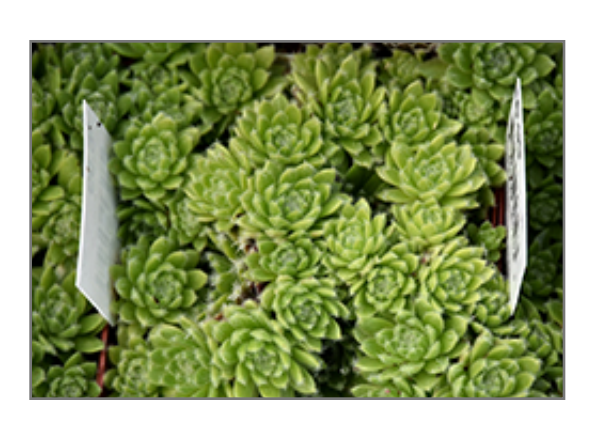
Allison Hens And Chicks

This selection features very symmetrical, tightly packed leaves that emerge green and mature to rusty red, becoming exceptionally fuzzy; pretty pink star flowers appear in summer; ideal for rock gardens and containers