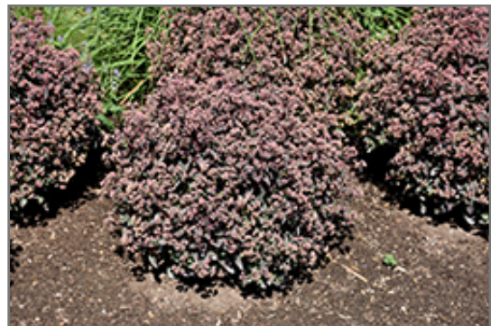
Rock 'N Grow Tiramisu Stonecrop in bloom