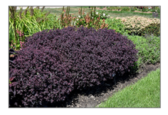
Strawberry Milkshake Stonecrop in bloom