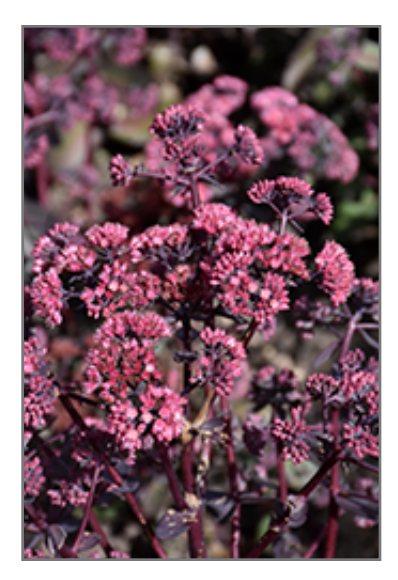
Strawberry Milkshake Stonecrop flowers

Strawberry Milkshake Stonecrop is a dense herbaceous perennial with an upright spreading habit of growth. Its relatively coarse texture can be used to stand it apart from other garden plants with finer foliage.