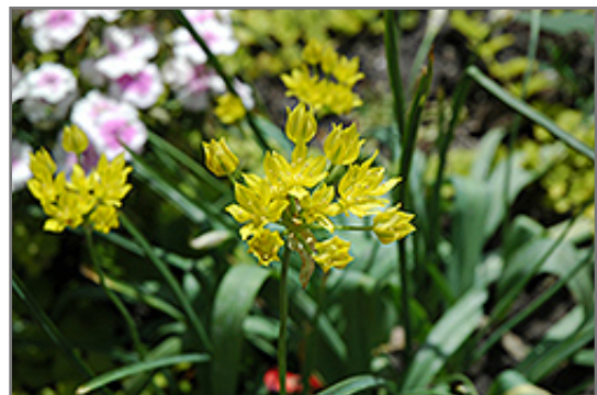
Golden Garlic flowers