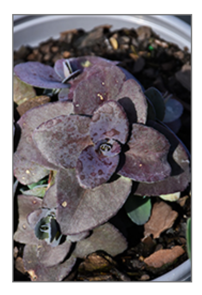
Mojave Jewels Sapphire Stonecrop foliage

This outstanding variety features bluish-green foliage that darkens to steel blue in sun; bright baby pink flowers appear in late summer to early fall on sturdy, upright stems; very showy in a mass planting, prefers poor soils and dry conditions