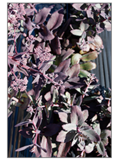
Mojave Jewels Diamond Stonecrop

This outstanding variety features reddish-green foliage that darkens to deep red-blue in sun; bright rose-pink flowers appear in late summer to early fall on sturdy, upright stems; very showy in a mass planting, prefers poor soils and dry conditions