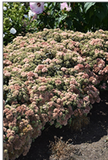
Rock 'N Grow Coraljade Stonecrop in bloom

This is a relatively low maintenance plant, and is best cleaned up in early spring before it resumes active growth for the season. It is a good choice for attracting butterflies to your yard, but is not particularly attractive to deer who tend to leave it alone in favor of tastier treats. It has no significant negative characteristics.