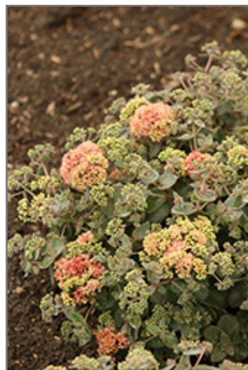
Rock 'N Grow Coraljade Stonecrop flowers