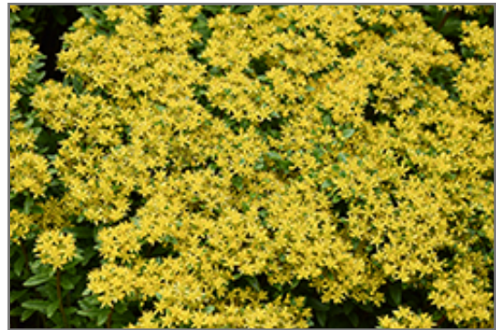
Rock 'N Round Bright Idea Stonecrop flowers

Rock 'N Round Bright Idea Stonecrop is a dense herbaceous perennial with a mounded form. Its medium texture blends into the garden, but can always be balanced by a couple of finer or coarser plants for an effective composition.