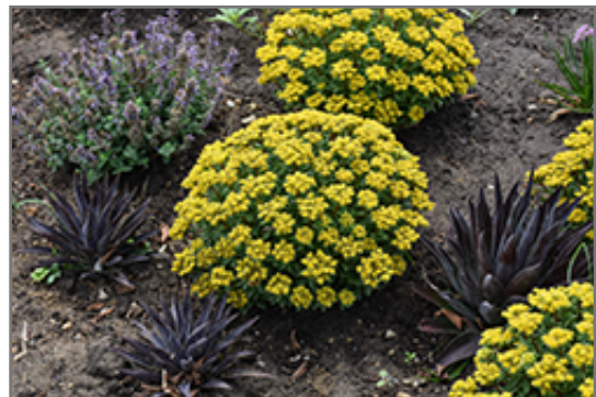
Rock 'N Round Bright Idea Stonecrop in bloom