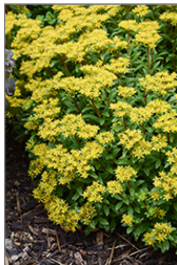
Rock 'N Round Bright Idea Stonecrop in bloom