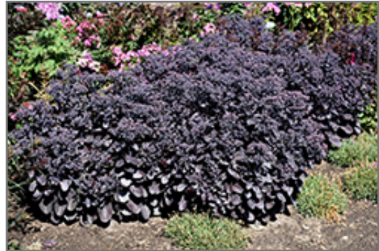
Rock 'N Grow Back in Black Stonecrop in bloom

Rock 'N Grow Back in Black Stonecrop has masses of beautiful clusters of creamy white star-shaped flowers with cherry red eyes at the ends of the stems from late summer to early fall, which emerge from distinctive crimson flower buds, and which are most effective when planted in groupings. The flowers are excellent for cutting. Its attractive large succulent round leaves emerge burgundy in spring, turning black in colour with showy dark gray variegation and tinges of coppery-bronze throughout the season. The deep purple stems are very colorful and add to the overall interest of the plant.