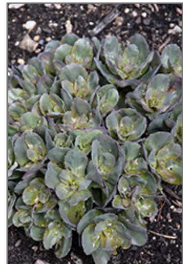
Rock 'N Grow Back in Black Stonecrop foliage