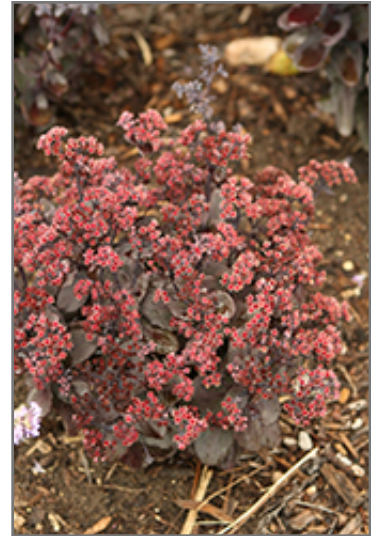
Rock 'N Grow Back in Black Stonecrop flowers