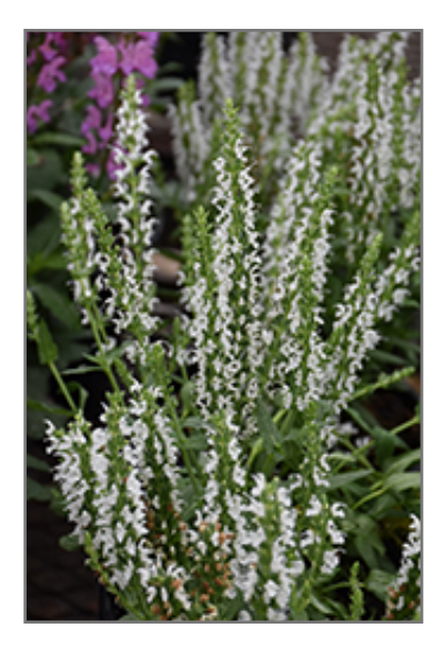
Sensation White Meadow Sage flowers

A bushy variety with stunning spikes of long lasting and large white flowers; somewhat drought tolerant; excellent for the sunny border or containers