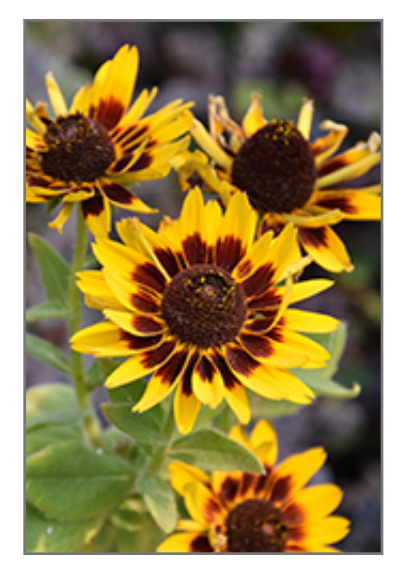
Dakota Flame Coneflower flowers

This striking selection features golden-yellow blooms with contrasting near-black flares radiating from the petal bases; flowers from early summer into fall; best treated as an annual; wonderful along borders or in containers; perfect for cutting