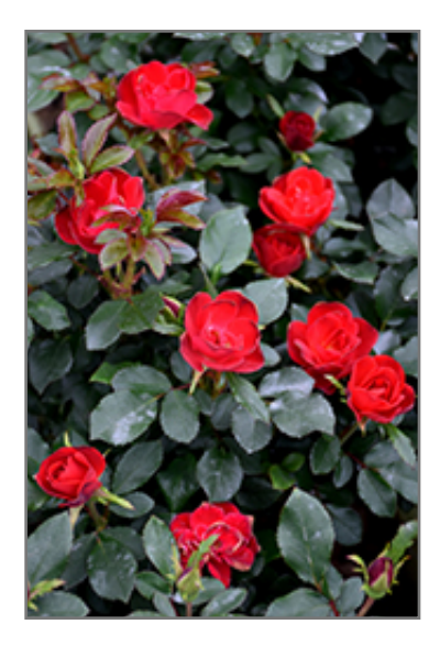
Petite Knock Out Rose flowers

Petite Knock Out Rose is recommended for the following landscape applications;