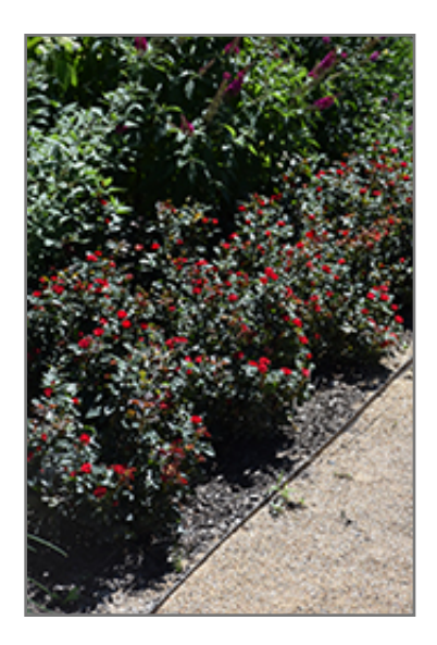
Petite Knock Out Rose in bloom