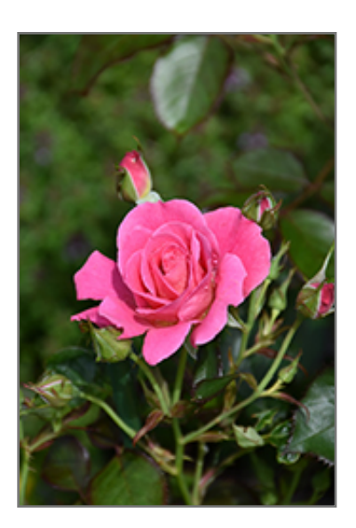
Aurora Borealis Rose flowers