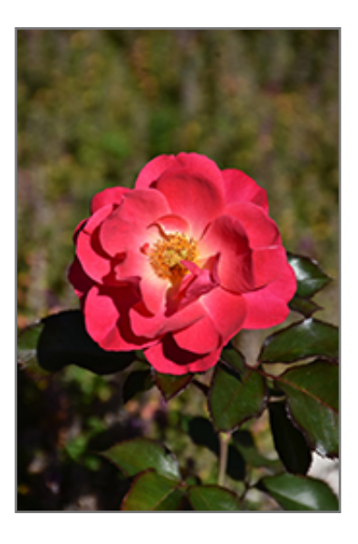
Aurora Borealis Rose flowers