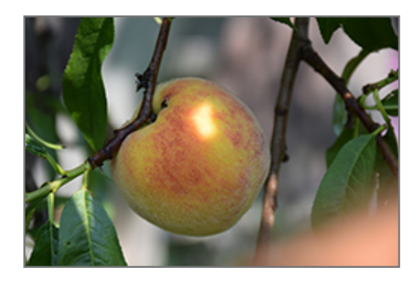
Stark Earliglo Peach fruit

Stark Earliglo Peach is clothed in stunning clusters of fragrant pink flowers along the branches in early spring, which emerge from distinctive rose flower buds before the leaves. It has dark green deciduous foliage. The narrow leaves turn yellow in fall. The fruits are showy yellow drupes with a scarlet blush, which are carried in abundance from early to mid summer. The fruit can be messy if allowed to drop on the lawn or walkways, and may require occasional clean-up.