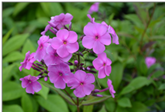
Super Ka-Pow Pink Garden Phlox flowers

Super Ka-Pow Pink Garden Phlox is recommended for the following landscape applications;