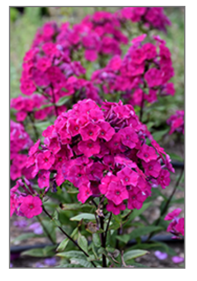
Super Ka-Pow Fuchsia Garden Phlox flowers

Long lasting, fragrant, bright fuchsia flowers begin to emerge in late spring; series has exceptional branching characteristics with large flowers in abundance all season; suitable for containers or perennial borders; good mildew resistance