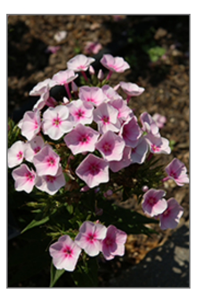
Flame Pro Baby Doll Garden Phlox flowers

An early flowering variety, producing blooms of fragrant, bright pink flowers with white halos, on compact plants suitable for the front of borders; provides a long season of color; thick, glossy green foliage has excellent mildew resistance