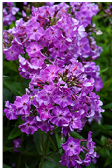
Early Purple Eye Garden Phlox flowers