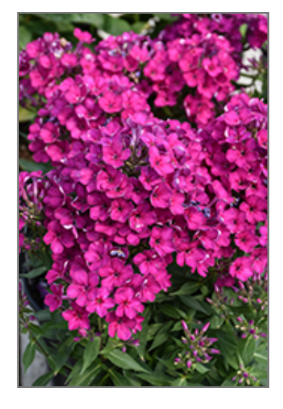
Early Cerise Garden Phlox flowers