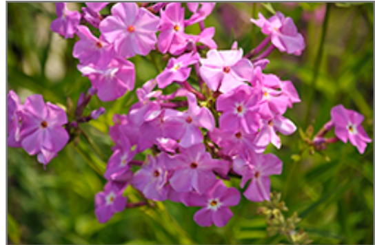
Opening Act Romance Phlox flowers

This plant will require occasional maintenance and upkeep, and should not require much pruning, except when necessary, such as to remove dieback. It is a good choice for attracting butterflies and hummingbirds to your yard, but is not particularly attractive to deer who tend to leave it alone in favor of tastier treats. It has no significant negative characteristics.