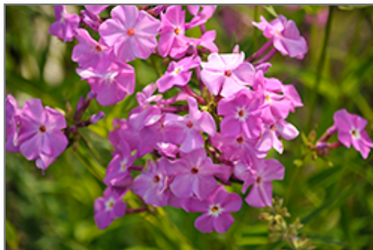
Opening Act Romance Phlox flowers