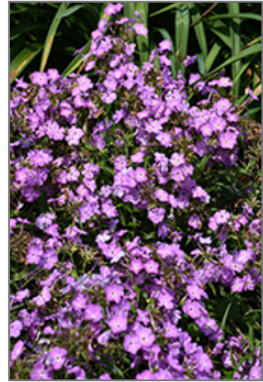
Opening Act Romance Phlox flowers

Opening Act Romance Phlox is a fine choice for the garden, but it is also a good selection for planting in outdoor containers and hanging baskets. It can be used either as 'filler' or as a 'thriller' in the 'spiller-thriller-filler' container combination, depending on the height and form of the other plants used in the container planting. Note that when growing plants in outdoor containers and baskets, they may require more frequent waterings than they would in the yard or garden. Be aware that in our climate, most plants cannot be expected to survive the winter if left in containers outdoors, and this plant is no exception. Contact our experts for more information on how to protect it over the winter months.