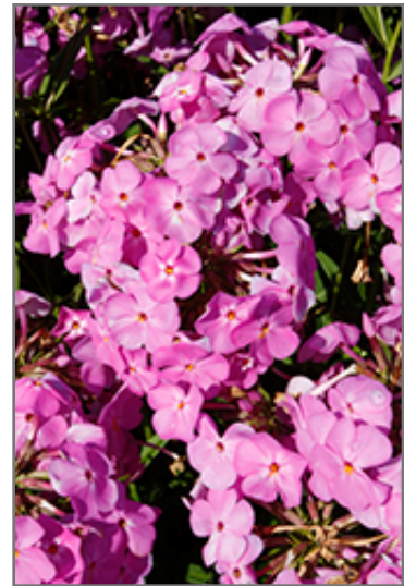
Magenta Pearl Garden Phlox flowers