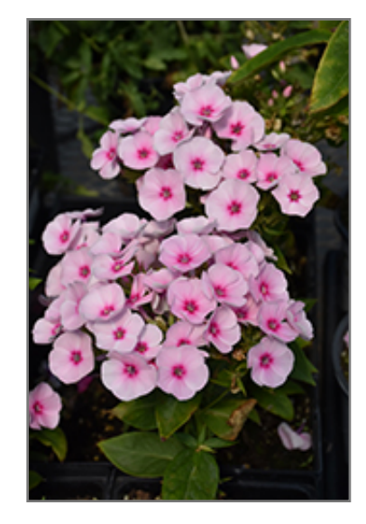
Baby Doll Pink Garden Phlox flowers

Baby Doll Pink Garden Phlox is a dense herbaceous perennial with an upright spreading habit of growth. Its medium texture blends into the garden, but can always be balanced by a couple of finer or coarser plants for an effective composition.