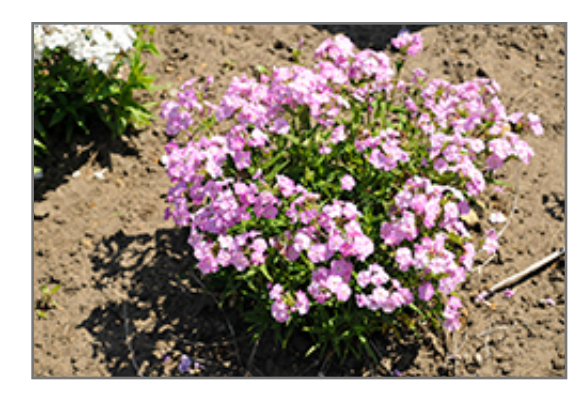
Baby Doll Pink Garden Phlox in bloom