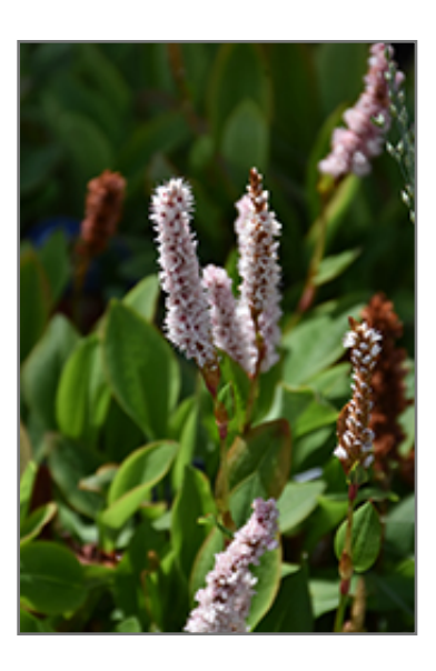
Dimity Dwarf Fleeceflower flowers

This variety forms a spreading mat of deep green, leathery leaves that turn bronze-red in fall; short spikes of deep red flowers appear in summer, fading to soft pink; an excellent groundcover that tolerates light foot traffic