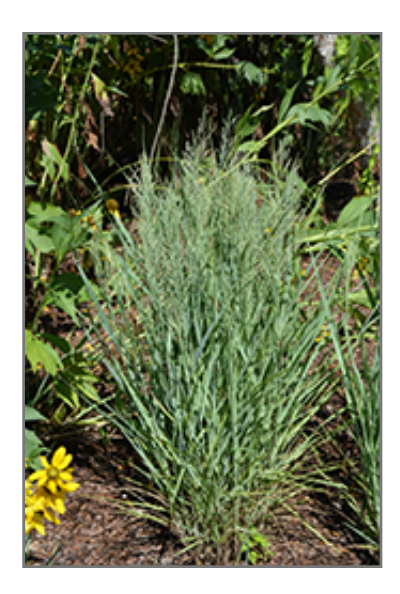
Gunsmoke Switch Grass