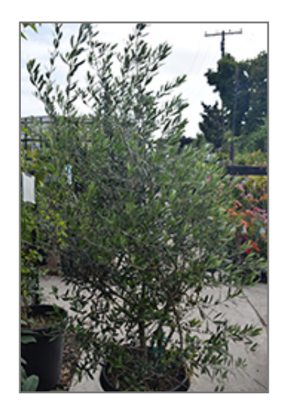
Wilson Fruitless Olive