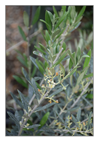
Wilson Fruitless Olive flowers

Wilson Fruitless Olive is recommended for the following landscape applications;