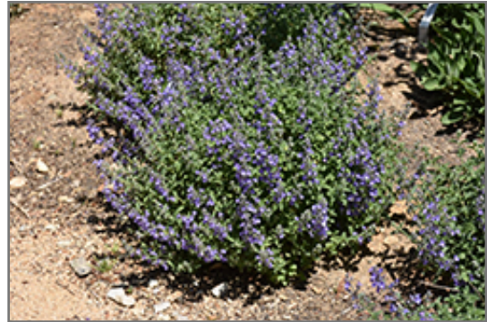
Sylvester Blue Catmint in bloom

Sylvester Blue Catmint is recommended for the following landscape applications;