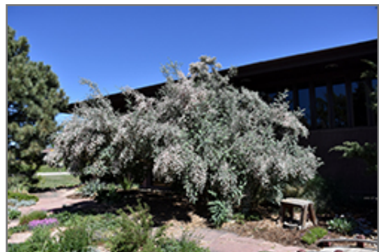
Blue Velvet Honeysuckle in bloom