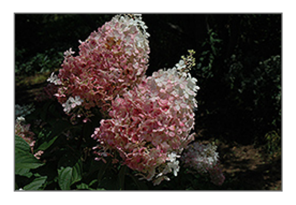
Fraise Melba Hydrangea flowers

A stunning hydrangea, presenting enormous, conical, upright flower heads that emerge white, changing from early summer to shades of pink, rose, and strawberry red, finishing with purplish tones in fall; beautiful when massed or as a solitary accent