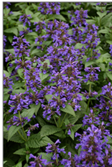
Neptune Catmint flowers