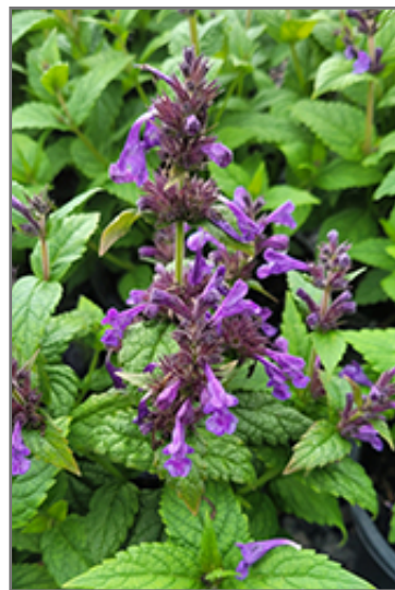
Neptune Catmint flowers