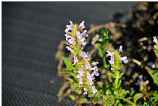
Pink Cat Catmint flowers