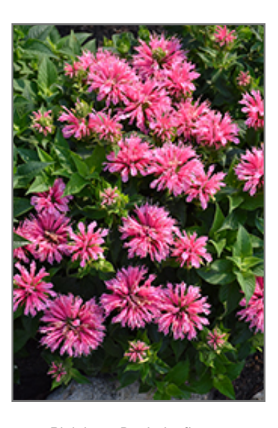
Pink Lace Beebalm flowers

A compact, upright form of bee balm that produces abundant heads of bright pink flowers in mid summer, above dense, rounded clumps of bright green foliage; good disease resistance; great for massing in the middle of flower borders