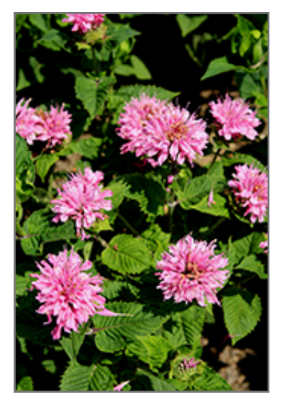
Marje Pink Beebalm flowers

This variety forms a dense, compact mound of very large, vivid pink flowers, on sturdy stems; attractive dark green foliage has an excellent resistance to powdery mildew; great for massing along informal borders