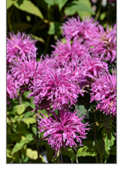
BeeMine Pink Beebalm flowers

Electric pink flowers with dark brown buttons over lush dark green foliage that has an excellent resistance to powdery mildew; a fascinating addition to the summer garden; attracts pollinators