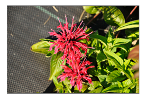
BeeMine Red Beebalm flowers

This plant will require occasional maintenance and upkeep, and should be cut back in late fall in preparation for winter. It is a good choice for attracting bees, butterflies and hummingbirds to your yard, but is not particularly attractive to deer who tend to leave it alone in favor of tastier treats. Gardeners should be aware of the following characteristic(s) that may warrant special consideration;