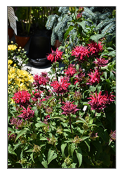
BeeMine Red Beebalm flowers

BeeMine Red Beebalm is an herbaceous perennial with a mounded form. Its medium texture blends into the garden, but can always be balanced by a couple of finer or coarser plants for an effective composition.