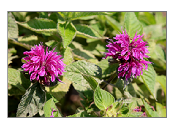
Bee-You Bee-Free Beebalm flowers

Electric purple flowers with dark brown buttons over lush dark green foliage that has an excellent resistance to powdery mildew; a fascinating addition to the summer garden; attracts pollinators