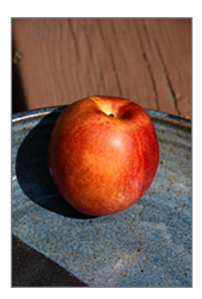
Goldmine Nectarine fruit

Goldmine Nectarine is covered in stunning clusters of fragrant pink flowers along the branches from late winter to early spring, which emerge from distinctive rose flower buds before the leaves. It has dark green deciduous foliage. The narrow leaves turn yellow in fall. The fruits are showy gold drupes with a red blush, which are carried in abundance from early to mid summer. The fruit can be messy if allowed to drop on the lawn or walkways, and may require occasional clean-up.