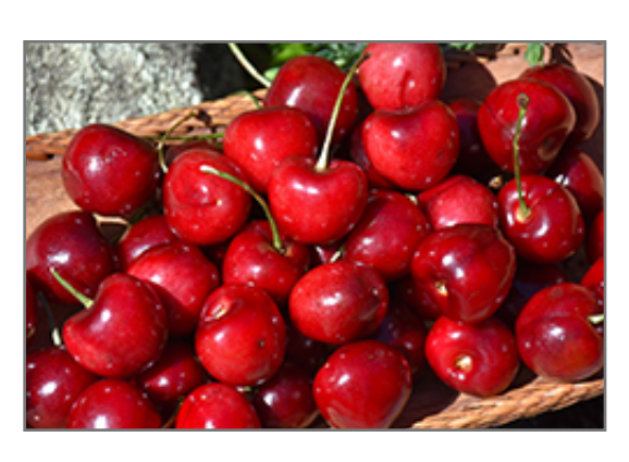
Minnie Royal Cherry fruit